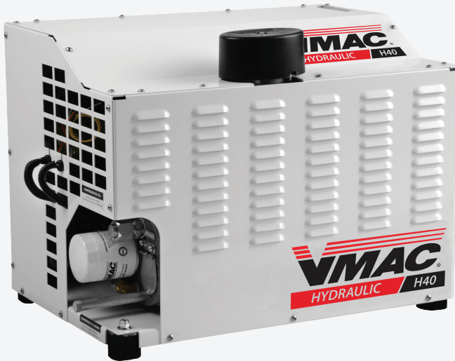
H40 & H60

THE SMARTEST, SMALLEST AND MOST POWERFUL HYDRAULIC AIR COMPRESSOR AVAILABLE.